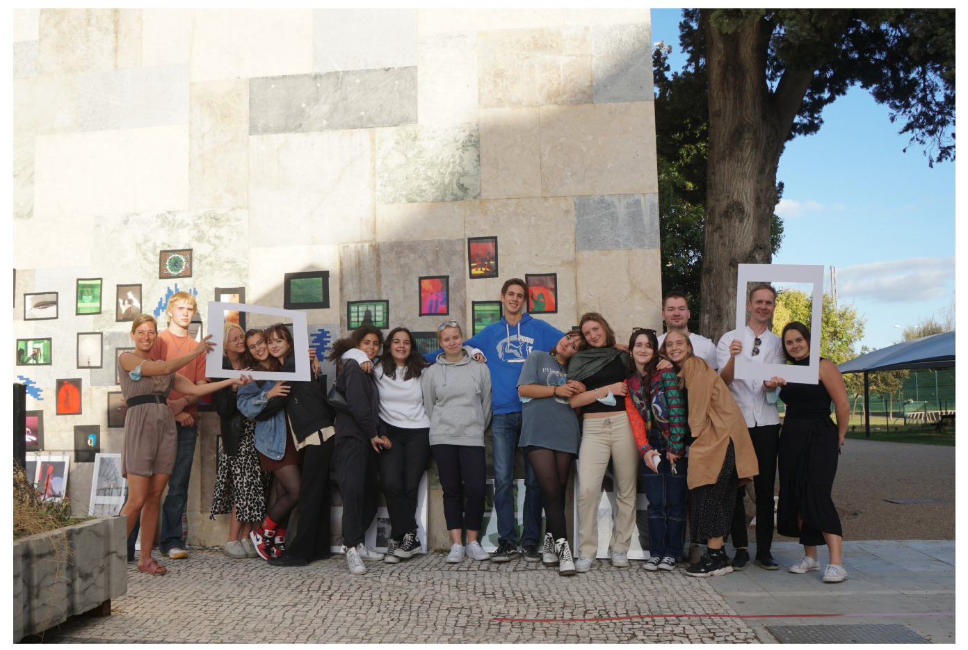
Group photo from the photography exhibition at Deutsche Schule Lissabon 2021

More photos from the exhibition: http://readymag.com/u1562946007/3188552/2/